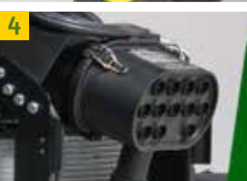
Engine Air Filter